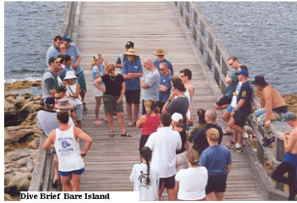
Dive Brief Bare Island